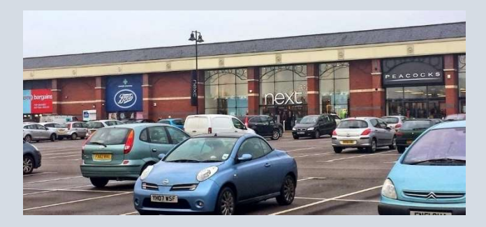
Out-of-town Woolworths site - previously a Big W - in Newark-on-Trent (store #1245), now subdivided four ways