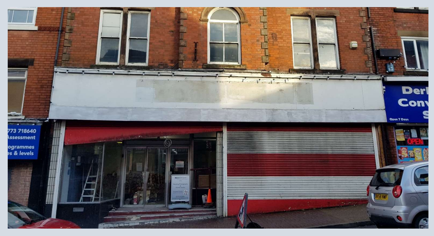
With few clues online to verify its current use, we visited the Heanor ex-Woolworths (store #549) in person in December 2018. This confirmed that, after spells housing a charity shop and a furniture shop, a photography studio is now trading from the upstairs, while the ground floor appears to be being converted into units for other small businesses

In a few instances, former Woolworths properties are currently vacant but have a confirmed occupant coming soon – such as Burnley, where Iceland is to move into the section of the ex-Woolworths site that was most recently occupied by Poundworld. In these cases, we have recorded the impending occupant, rather than counting the unit as vacant.