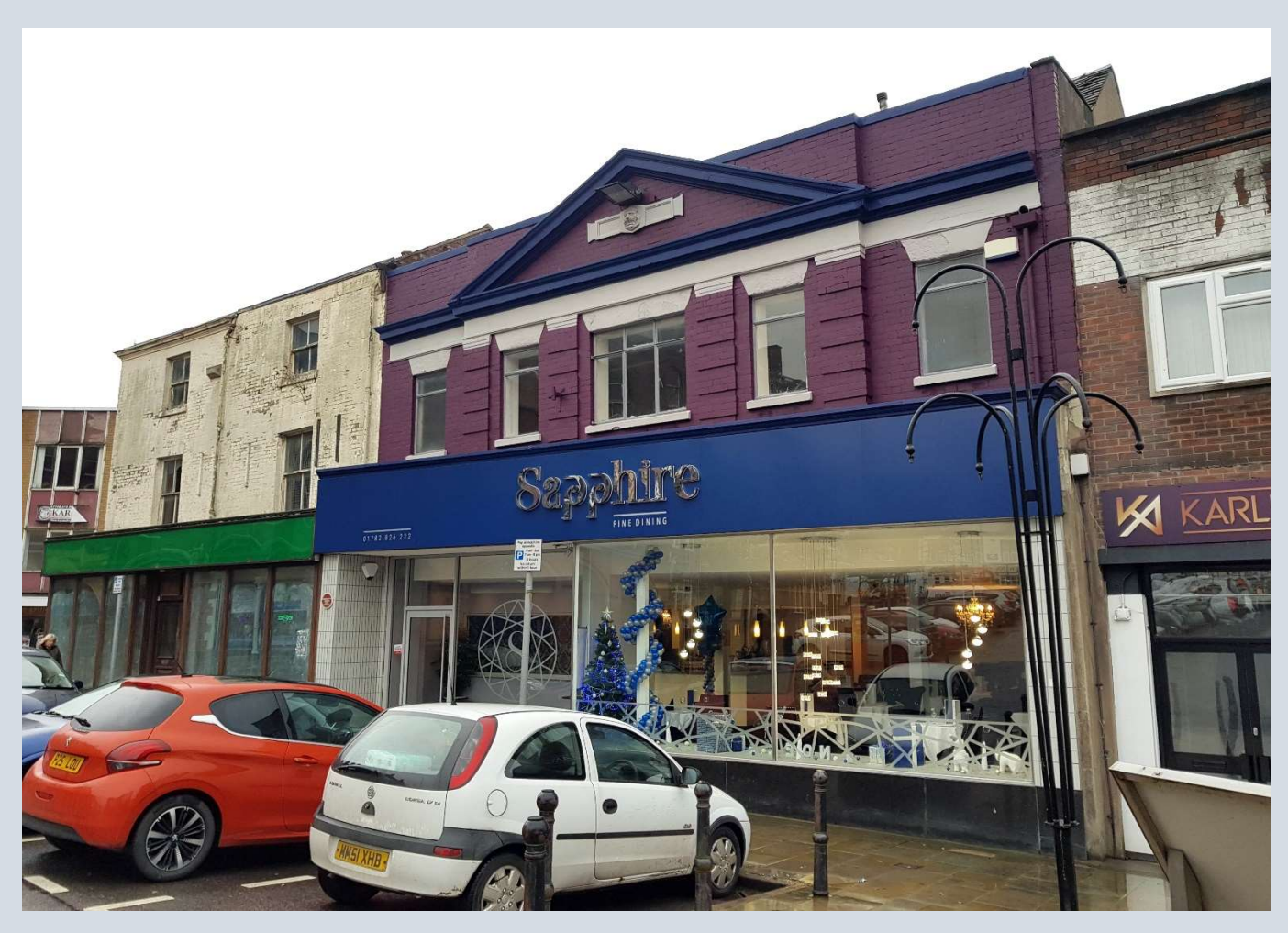
Burslem in Stoke-on-Trent has, somewhat unhelpfully, been badged the "empty shop capital" of Britain<sup>34</sup>, yet the November 2018 opening of a new restaurant, Sapphire Fine Dining, in the former Woolworths – following the departure, first, of Poundstretcher, and then Asian supermarket Quality Bazaar – demonstrates an important investment in the high street, and one independent's evident belief in the town's potential