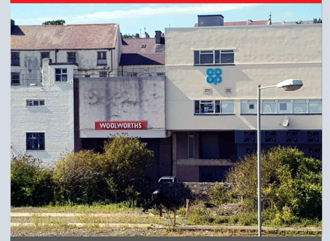
Rear of ex-Woolworths, Holyhead (store #806) in September 2018

From their vertical white tiles to the ubiquitous black-granite stall risers, former Woolworths buildings offer no shortage of architectural clues to their past.