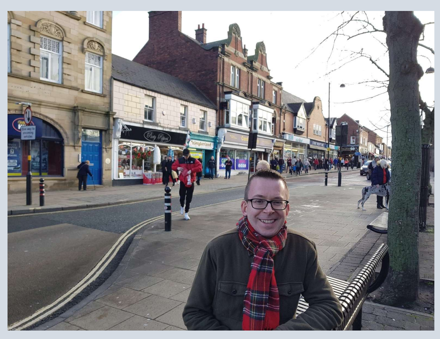
Graham in Chester-le-Street Front Street

Do get in touch if you think we can help your place or business – we'll be delighted to hear from you.