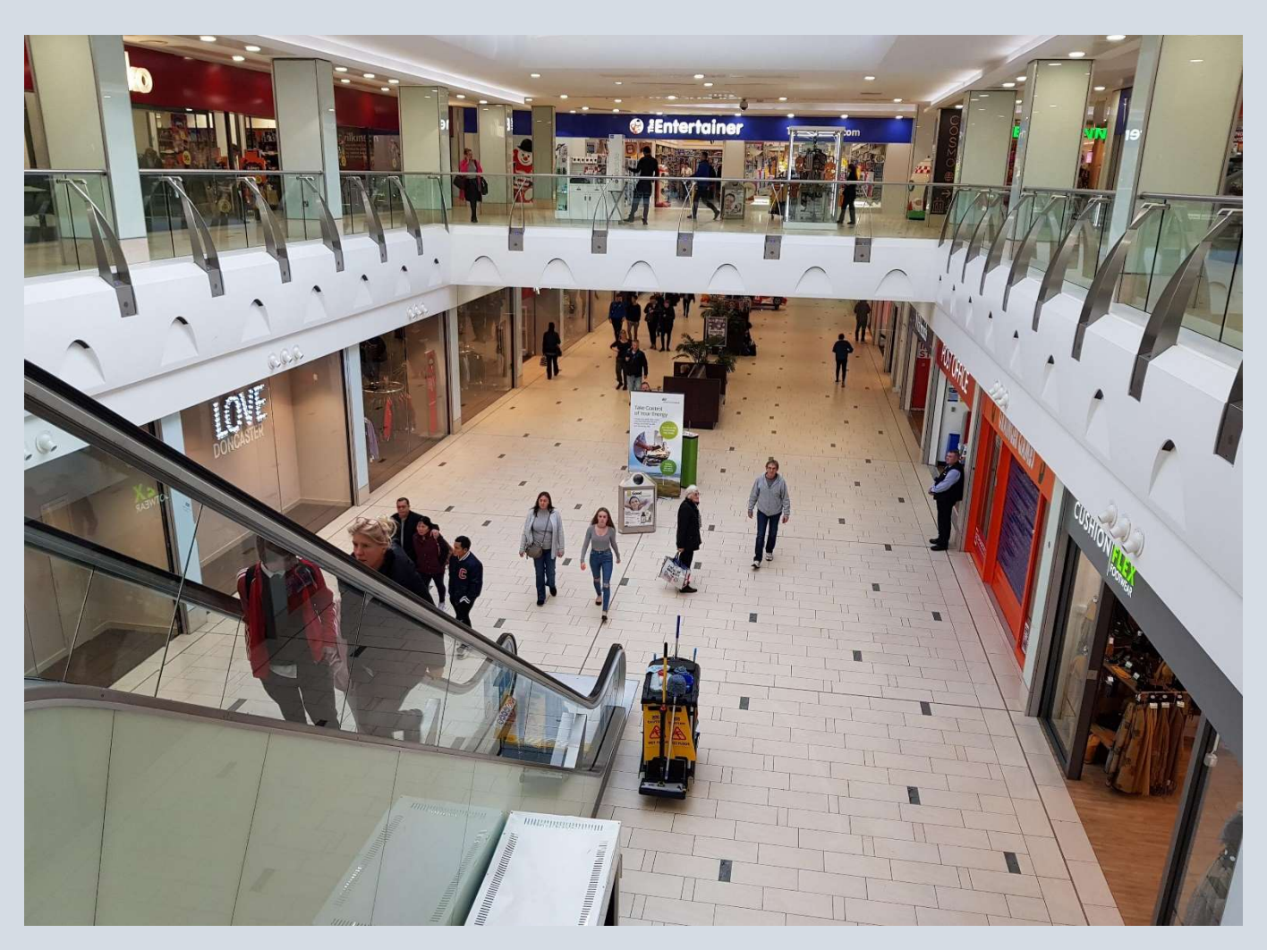
Divided between several occupants, and with no visual clues to its past use, Doncaster's former Woolworths (store #193), in the Frenchgate shopping centre, demonstrates the complexity of some locations. The two-level store was originally reoccupied mostly by Clas Ohlson, with Deichmann and Wilko (extending its existing store) also taking first-floor space. After Clas Ohlson closed, Toys R Us, and then The Entertainer, took the newly released first-floor space, with TK Maxx moving into the ground-floor section.

We also procured a further spreadsheet, made available to prospective occupants of former Woolworths stores, which again includes the address details of each store alongside extra information such as square footage and rent.