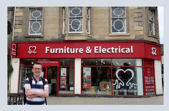
The British Heart Foundation occupies part of the former Woolworths in Leith, Edinburgh (store #180)