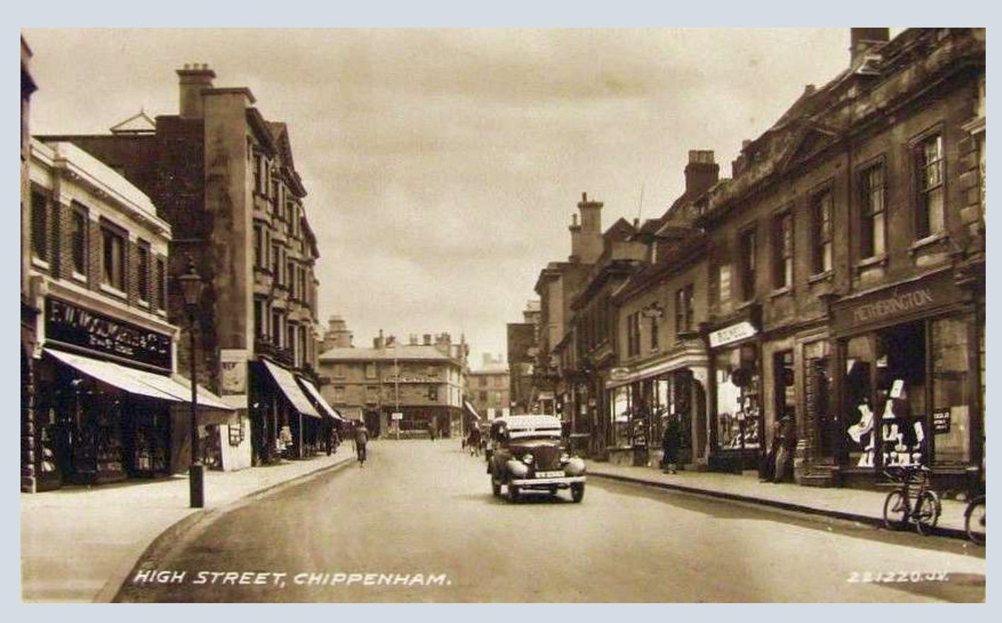
1933 postcard showing a distinctive purpose-built Woolworths store in Chippenham on the left (store #493). The frontage was remodelled in the 1970s, and the store traded from this site until Woolworths' collapse