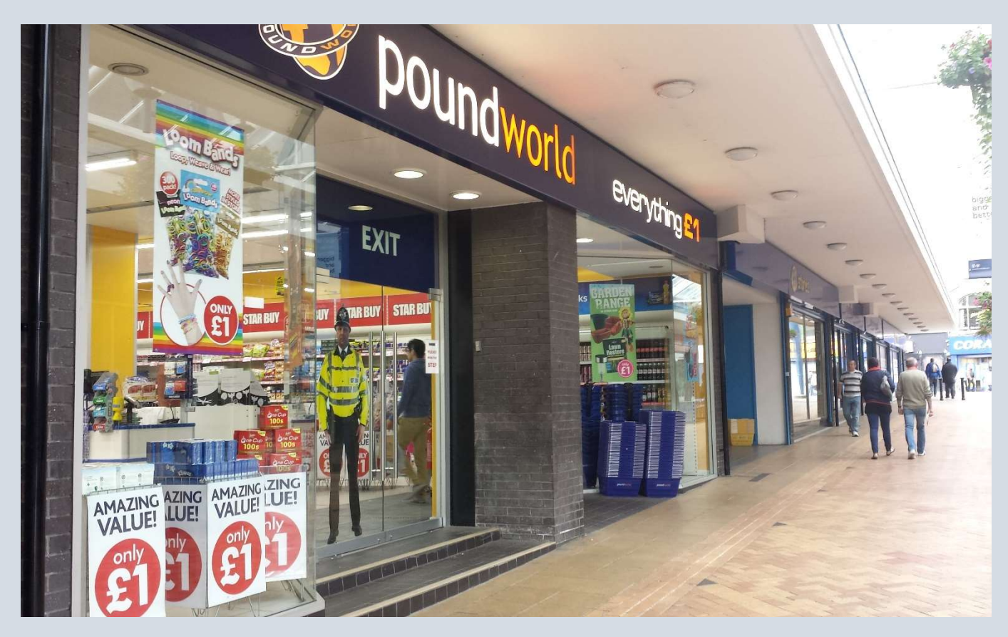
Pictured here in 2014, Burnley's ex-Woolworths (store #160) has seen the joint highest number of superseded post-Woolworths occupants, with five. After housing a YMCA charity shop (in the whole unit), followed by Peacocks and then Poundworld in one half, and 99p Stores and then Poundland in the other, it currently accommodates Wilko in the ex-Poundland and a soon-to-open Iceland in the former Poundworld