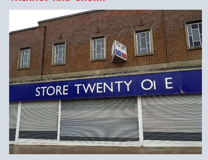
Former Woolworths in Stanley (store #873) in November 2018 – now empty again after the collapse of Store Twenty One