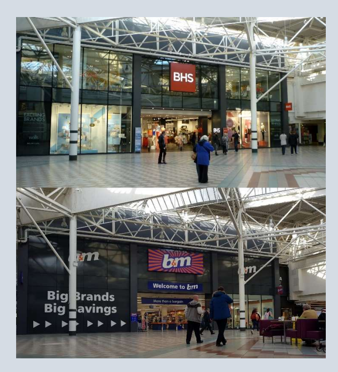
The former Woolworths in Hartlepool (store #322) as BHS in 2012 and then as B&M in 2018