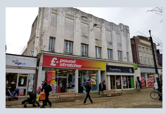
In Boscombe (store #179), Woolworths traded until the end in what is now Poundstretcher, but also occupied Superdrug's part until 1989

Elsewhere, there are many locations where Woolworths stores were shrunk in size over the years, as parts of sites were hived off – especially in the 1980s – to other retailers.