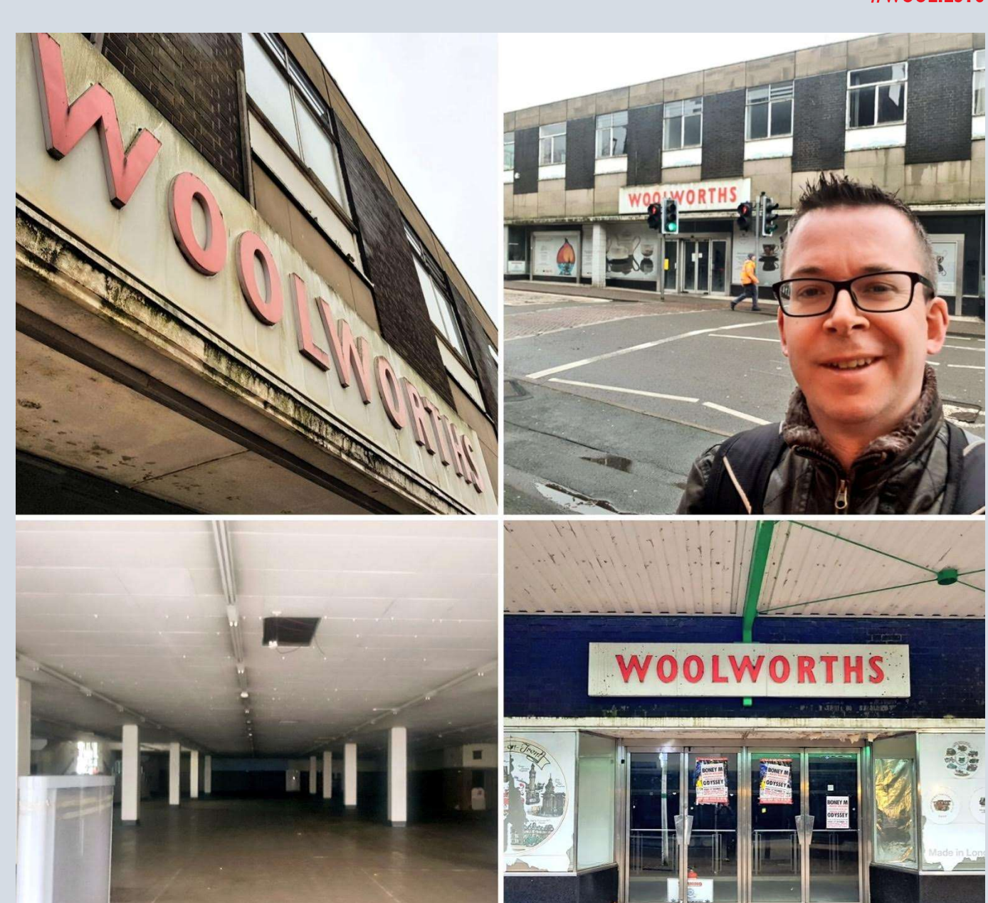
Former Woolworths in Longton, Stoke-on-Trent (store #258) in December 2018 — one of only four stores never to be reoccupied, and one of just two with its main Woolworths signage still intact