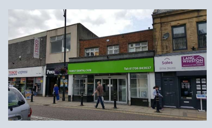
After a spell as Ethel Austin, the ex-Woolworths in Shaw, Oldham (store #1025) became a dentist's. A different dental practice has taken over the premises since this photo was taken in 2015