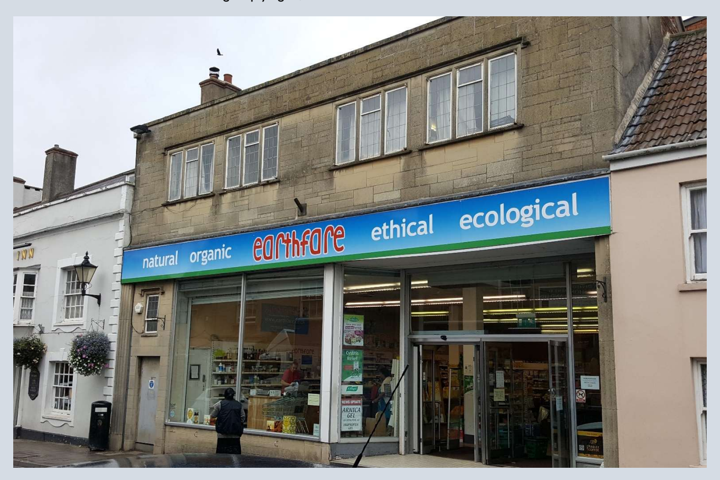
Natural and organic food shop Earthfare in Glastonbury (store #853) is among the independent businesses that have made a success of ex-Woolworths sites by being marketing savvy and tailoring their offer to what the local community wants and needs

Nevertheless, creative and well-run businesses that give customers a good-quality experience, and the products and services they want, will continue to be best placed to navigate the changing high street, and to seize any future opportunities – just as many occupants of old Woolworths sites are doing now.