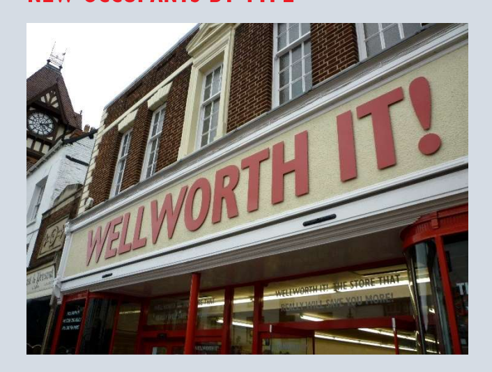
Wellworth It in Ledbury, opened in 2010, is one of relatively few independent businesses — and one of even fewer indies explicitly inspired by Woolworths — to make a success of an ex-Woolies location (store #696)