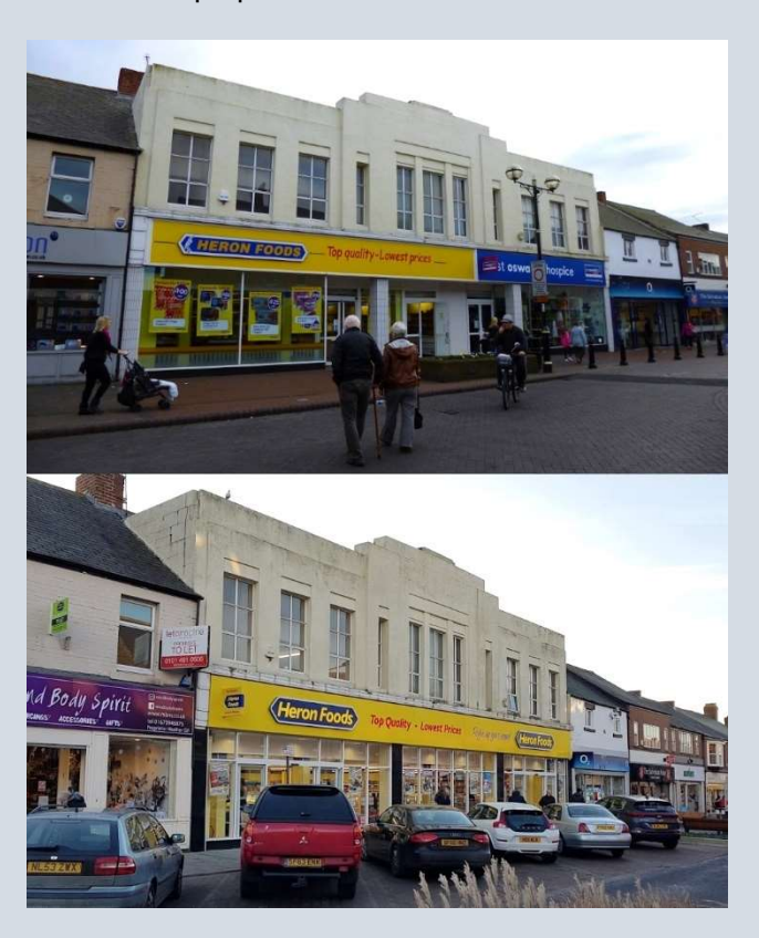
Heron Foods initially took the left-hand two thirds of the ex-Woolworths in Ashington (store #229), before then reunifying the ground floor in 2018 by expanding into the rest