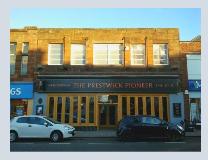
A Wetherspoon pub occupies the ex-Woolworths in Prestwick (store #694)