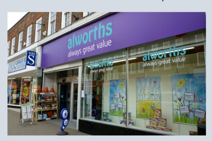
Ex-Woolworths in Amersham (store #766) as short-lived son-of-Woolies chain Alworths in 2010. The site is now Little Waitrose