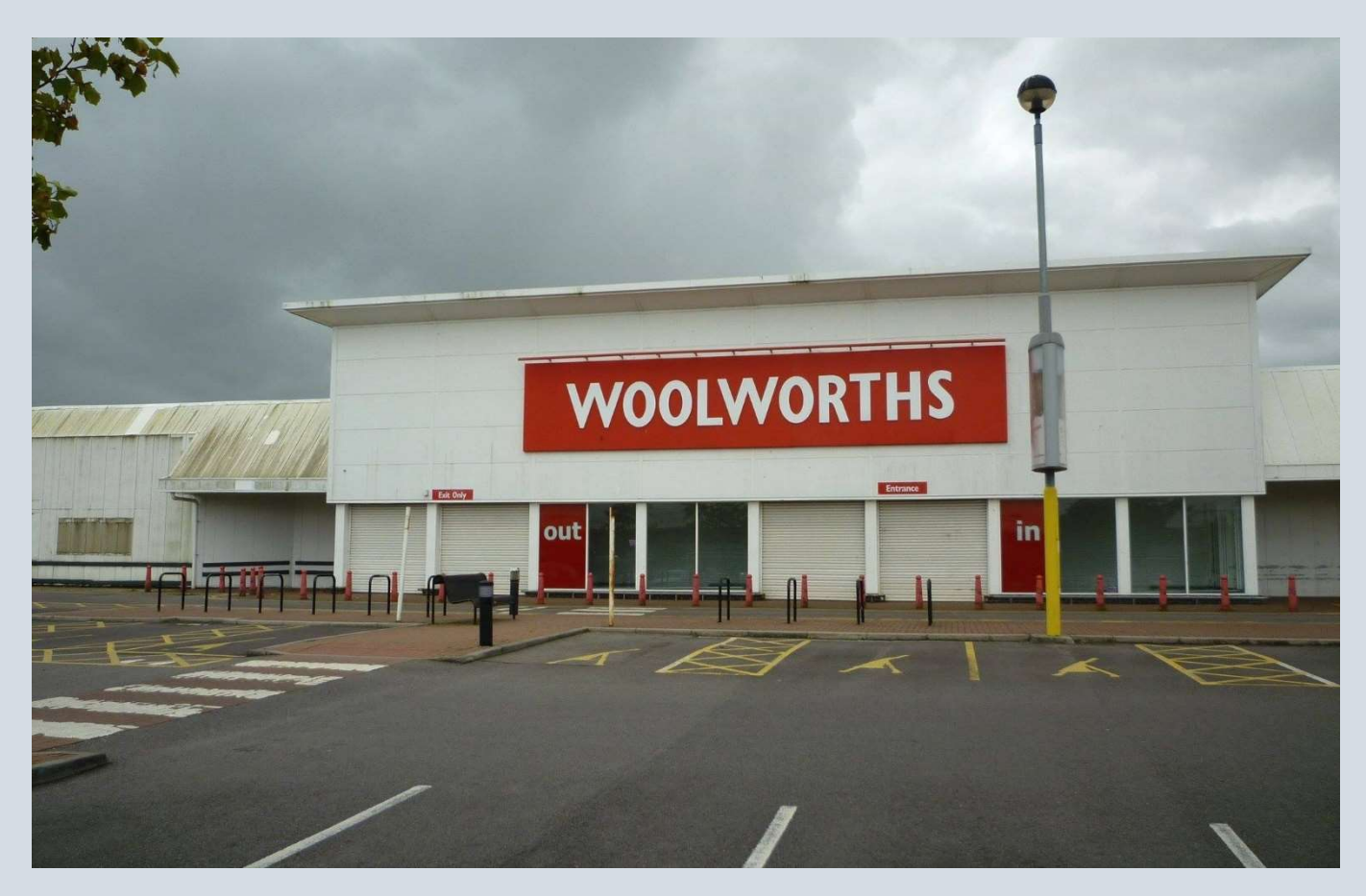
The former Woolworths (and previously Big W) in Filton (store #1223), pictured in 2011. The property was subsequently demolished and replaced with a purpose-built Asda store