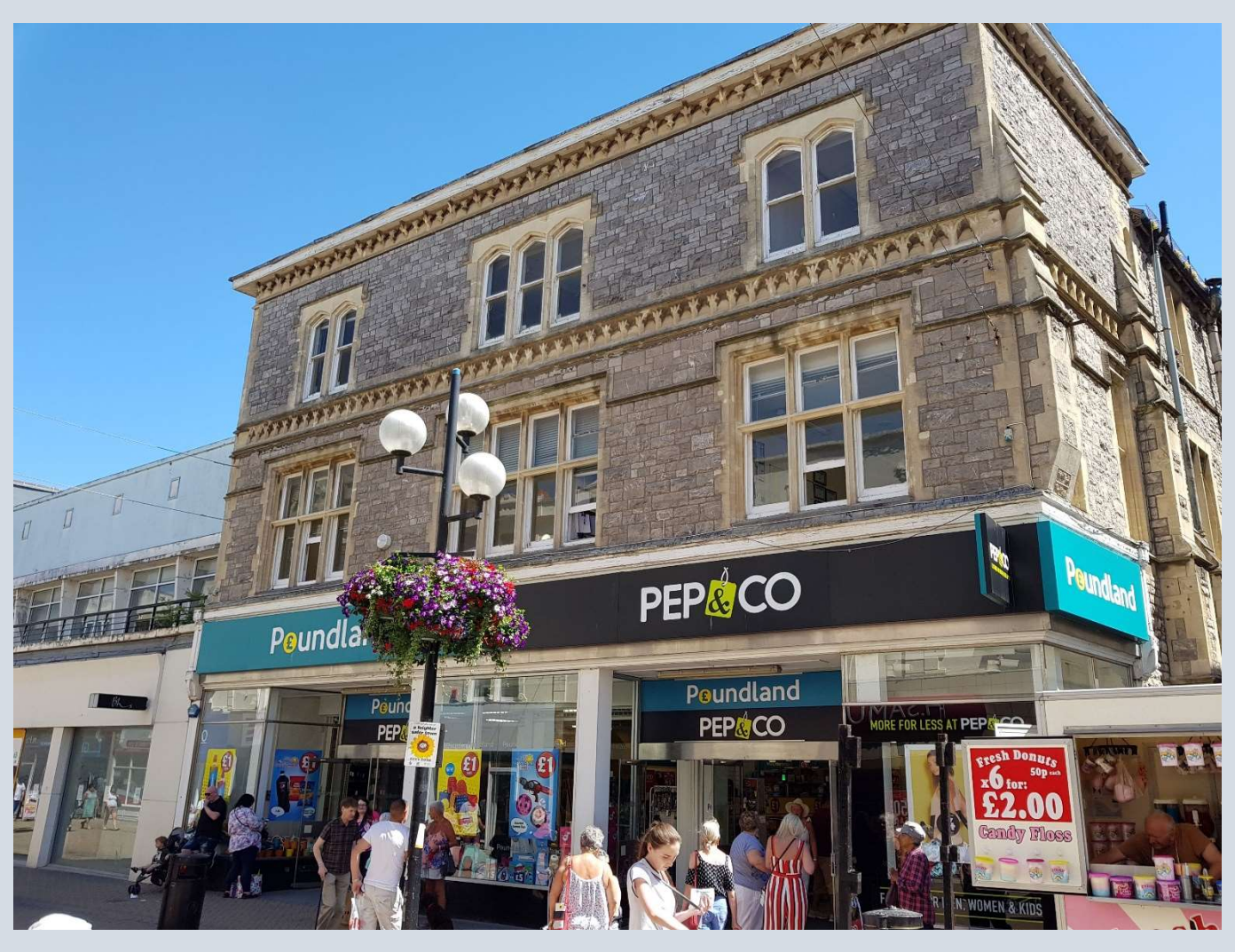
Combined Poundland and Pep&Co in the former Woolworths in Weston-super-Mare (store #81). This is one of seven Poundland stores in a former Woolworths originally taken over by the now-defunct Ethel Austin