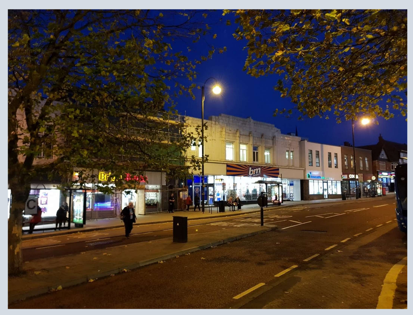
Former Woolworths, now B&M, Chester-le-Street (store #267)