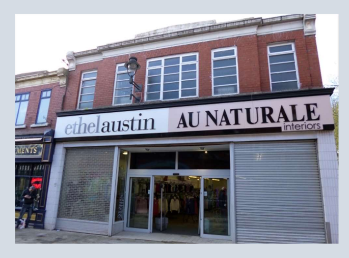
Ethel Austin – pictured at Prescot's ex-Woolworths (store #610) in 2012 – is a subsequent occupant that has itself now disappeared

By looking at the former Woolworths estate in this way, we gain a unique snapshot of commercial property activity across the UK, and a window on how the country's retail landscape has changed over the past decade.