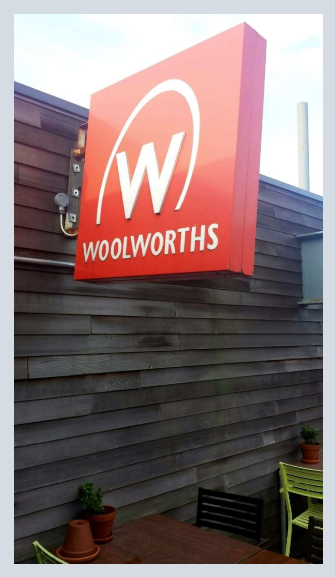
The Ludo Lounge bar on the site of Southbourne's ex-Woolworths (store #606) incorporates a fragment of its predecessor into the design of the new roof terrace