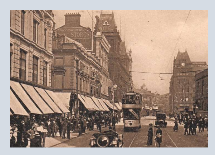
The very first UK Woolworths store (store #1), in Church Street, Liverpool, shown (centre) in a detail of a 1917 postcard. The store traded here until 1923, and then from across the street until 1983

Across that period – allowing for all its openings, closures and relocations over the years – there are over 1,400 UK sites that at one time housed a Woolworths branch.